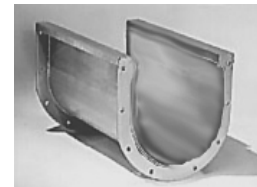
10ga. AR Steel U-Trough Liners