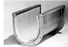
UHMW U-Trough Liners